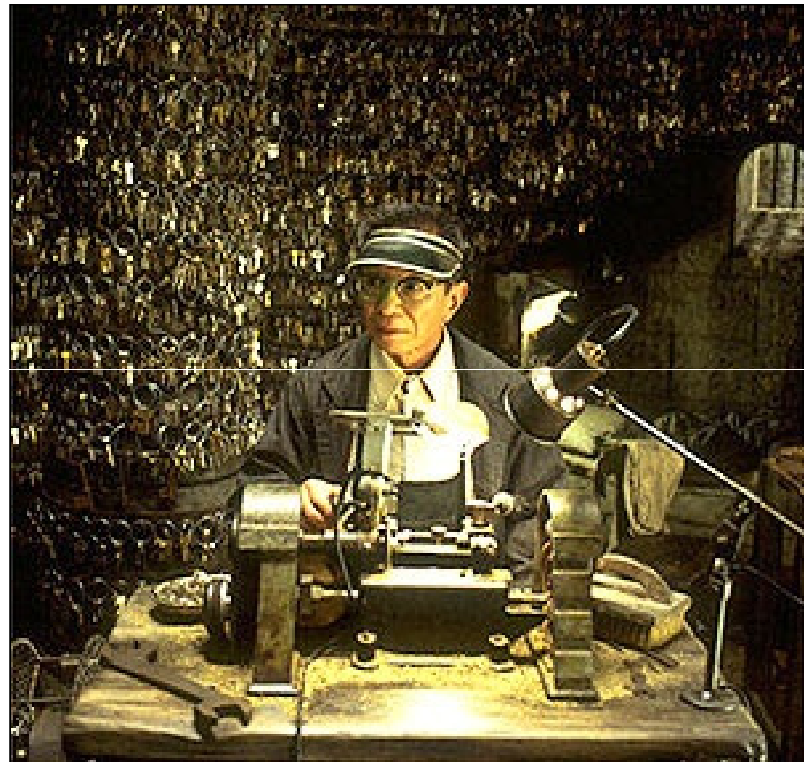
The Keymaker from “The Matrix Reloaded”

He is able to make keys that get him into secret areas of the Matrix.